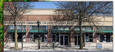
CULINARY ARTS AND HOSPITALITY CENTER

20 East Main Street, Riverhead, NY 11901