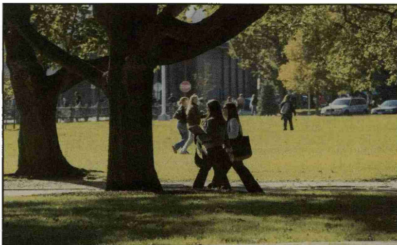
Nassau Community College campus in Garden City