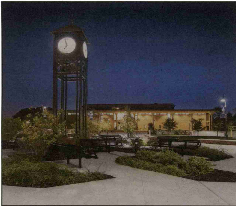
Suffolk Community College's Ammerman Campus in Selden