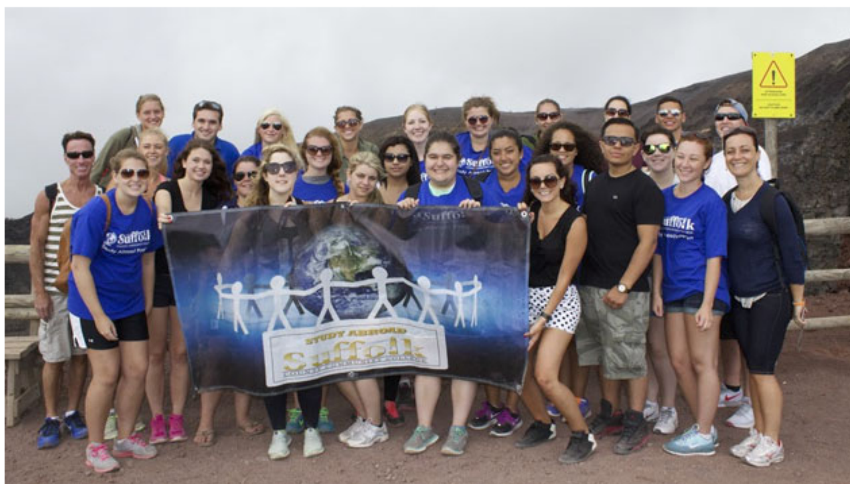
More than two-dozen Suffolk County Community College students will return to Long Island today after completing a four-week-long Study Abroad program in Sorrento (Italy) where they studied Intercultural Communication and Italian language at the renowned Sant'Anna Institute...