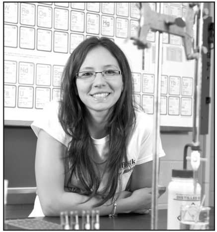
SCCC has a long history of producing award-winning science students.