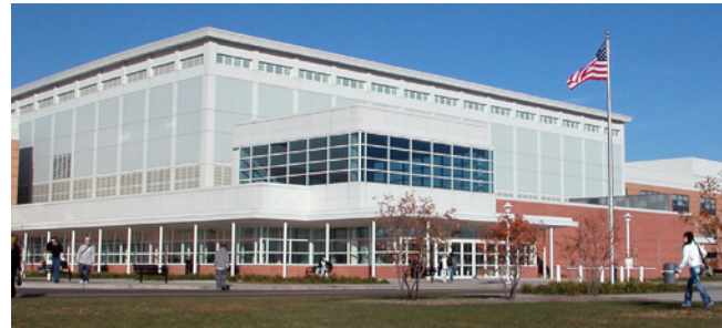
Michael J. Grant Campus

Suffolk COUNTY COMMUNITY COLLEGE sunysuffolk.edu/International