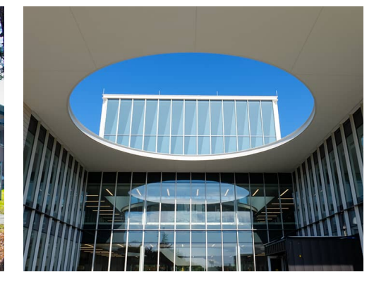
Michael J. Grant Campus

Learning Resource Center Information Commons