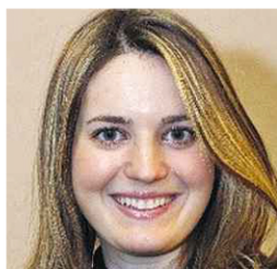
P.W. GROSSER CONSULTING