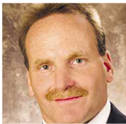
CULLEN & DANOWSKI