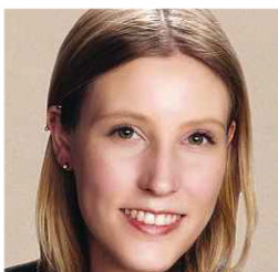
P.W. GROSSER CONSULTING