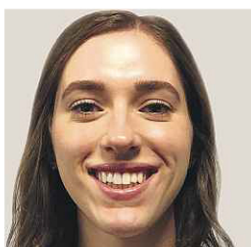
P.W. GROSSER CONSULTING